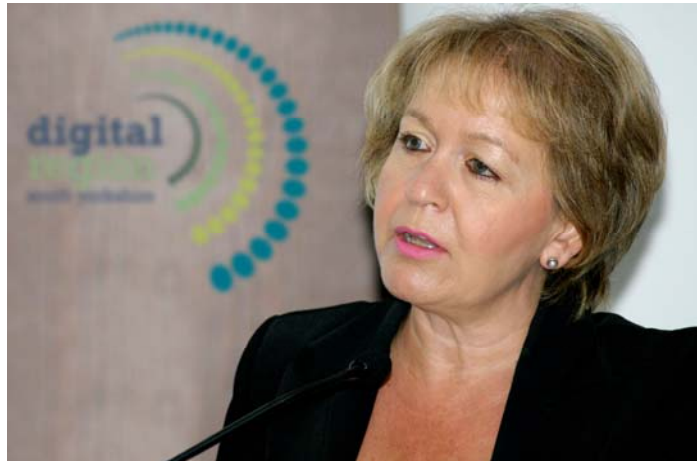
Rt Hon Rosie Winterton MP, Minister for Regional Economic Development and Coordination and Minister for Yorkshire and The Humber speaking at Digital Region's launch

Speaking at the launch, Minister for Yorkshire and The Humber, Rt Hon Rosie Winterton MP said: "Digital Region is significant not only because of the size of the investment but because it sends a clear message that we are investing in the future and preparing for economic recovery. Digital Region impacts on every aspect of economic and social life in South Yorkshire. It ensures we are ideally